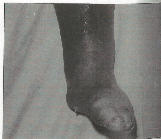
Figure 1. Acute cellulitis of a lower limb.

This article discusses how CV therapy is an effective treatment for cellulitis in community care, improving the results of oral antibiotic treatment and subsequently preventing hospital admission.